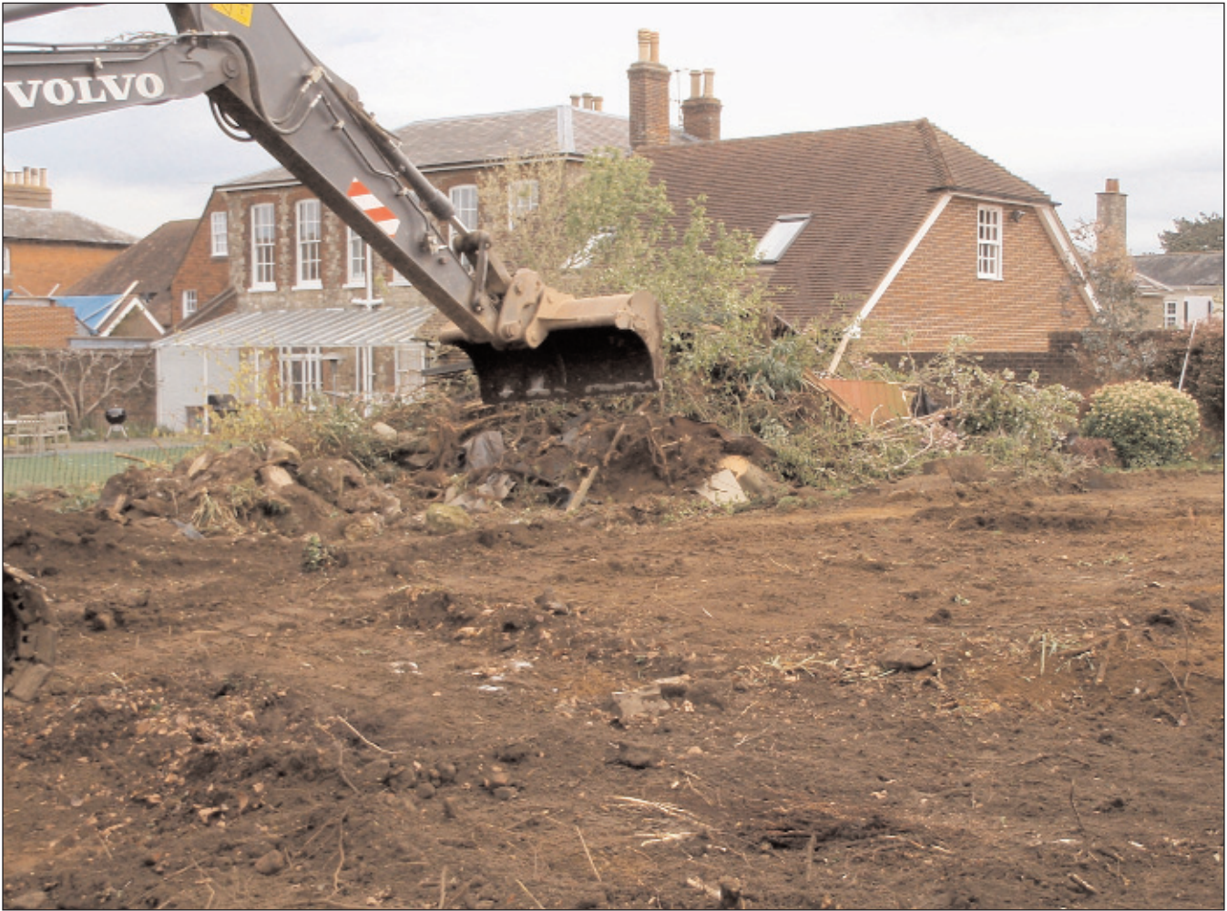
Plate 2. Topsoil stripping complete (facing north east).