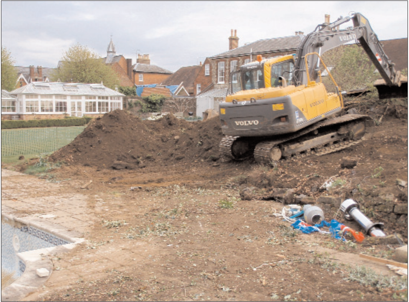
Plate 1. Topsoil stripping of site in progress by the pool (facing north).